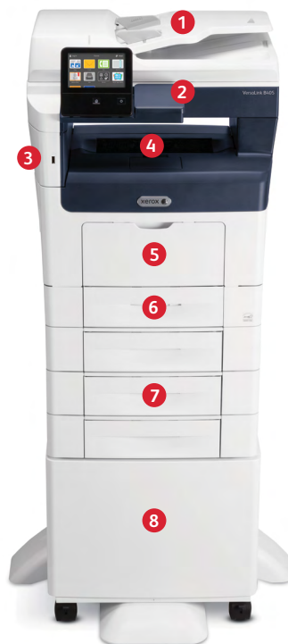
Xerox® VersaLink® B405 Multifunction Printer Print. Copy. Scan. Fax. Email.