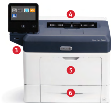
Xerox® VersaLink® B400 Printer Print.